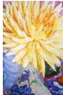
A close-up of Joseph Raffael's 'Solstice.' The exhibit runs through Aug. 20 at Fort Collins Museum of Contemporary Art.

Cost: $2; members, students and children ages 17 and younger admitted for free Information: 482-2787 or www.fcmoca.org